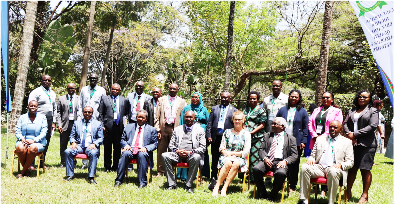
A group photo of stake holders during 13th EAQAN conference at Safari Park Hotel Nairobi Kenya on September 11th 2024