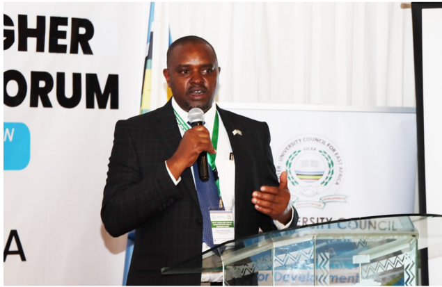
The president of EAQAN at the 13th Annual conference at Safari Park Hotel Nairobi Kenya on September 11th 2024