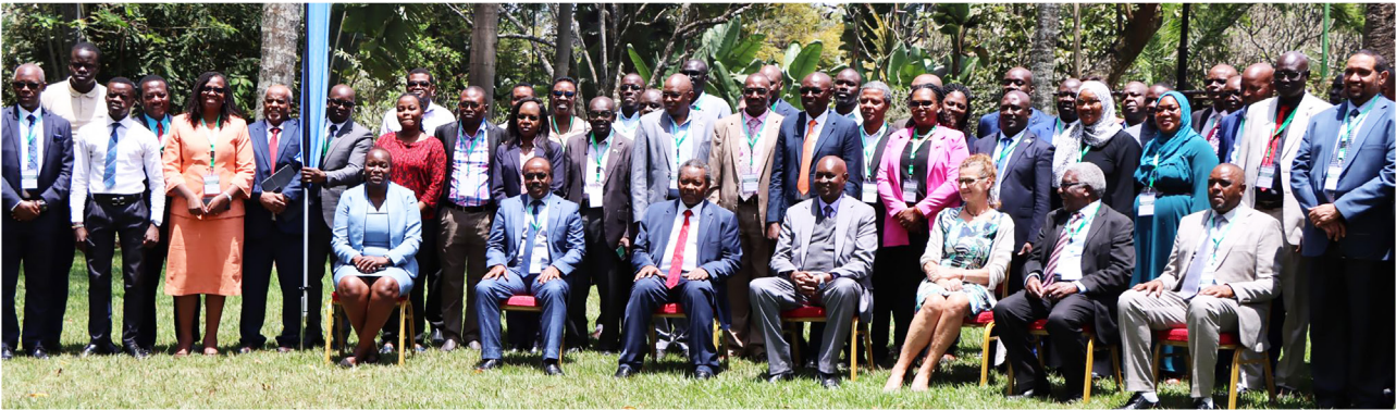
Stakeholders from IUCEA, EAQAN, CUE, DAAD, and OBREAL Global at Safari Park Hotel in Nairobi Kenya on the 9th of September 2024.