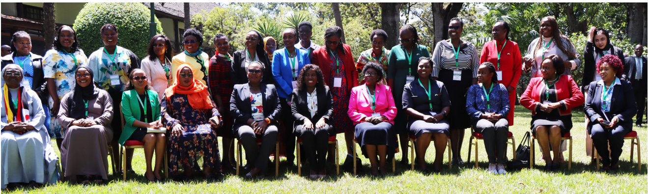
Women Representatives took a group photo with the Principal Secretary, Ministry of Education Kenya on the 11 of September 2024 at Safari Park Hotel, Kenya.