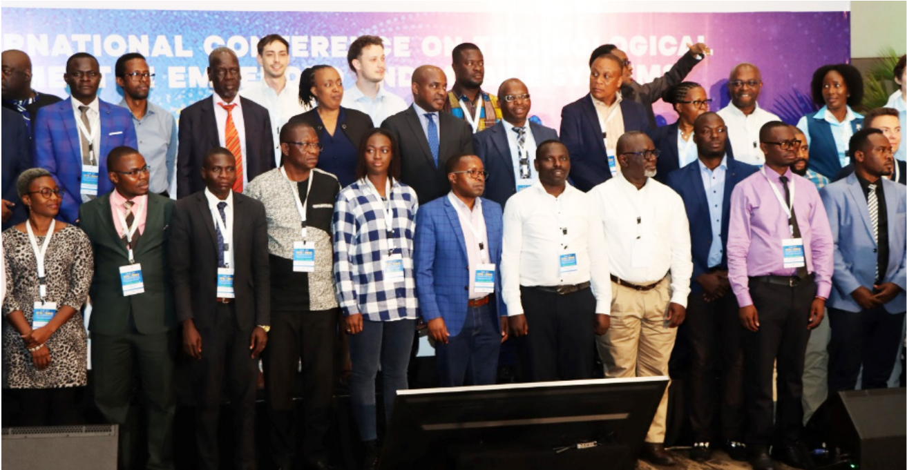
■ A group photo of the participants during the 2nd conference in Kigali Rwanda on 19th of Sep 2024