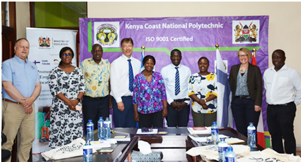
Delegation from Aboa Mare Maritime Academy and Kenya Coast National Polytechnic staff

Kenya Coast National Polytechnic and the National Institute of Transport in Tanzania have successfully implemented a student exchange programme as part of the East Africa Skills for Transformation and Regional Integration Project (EASTRIP), fostering collaboration among TVET institutes in East Africa.