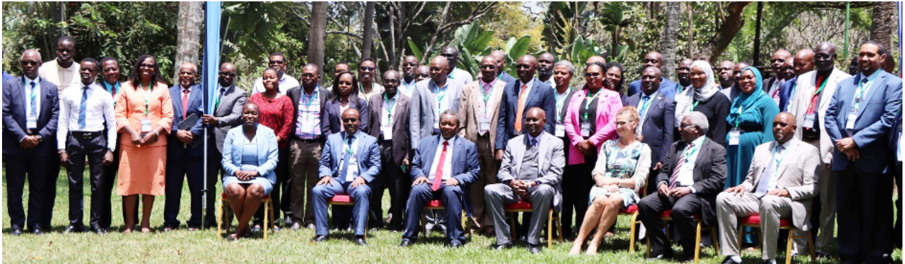
■ Stakeholders from IUCEA, EAQAN, CUE, DAAD, and OBREAL Global at Safari Park Hotel in Nairobi Kenya on the 9th of September 2024.

The 13th East African Quality Assurance Network conference concluded in Nairobi, Kenya, marking a significant milestone in the pursuit of enhanced higher education quality in the East African region. This pivotal event was co-organized by the Inter-University Council for East Africa (IUCEA), in collaboration with the East African Higher Education Quality Assurance Network (EAQAN) and the Commission for University Education, Kenya (CUE). The conference took place from September 9th to 12th, 2024, at the prestigious Safari Park Hotel in Nairobi, Kenya.